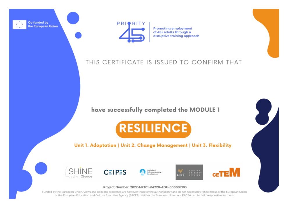
Example of Certificate

When completing an entire module, participants will be awarded a certificate listing all the units within that module. These certificates and badges are automatically generated by our platform each time a unit or module is completed. Each certificate and badge will be personalised with the participant's name, making it essential to accurately fill out the required fields during registration.